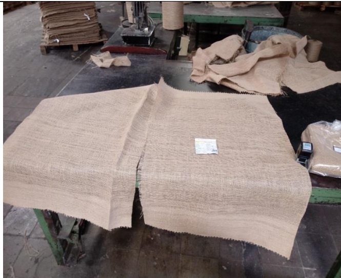
Sampling jute cloth Hilo No. 10 at Agave factory on June 25, 2021.