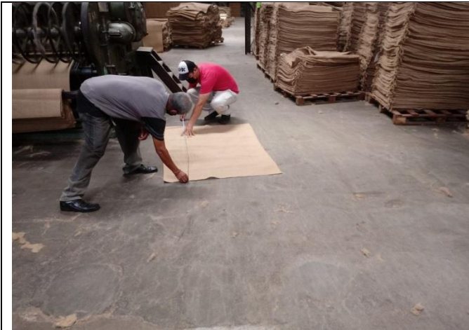
During sampling of Jute cloth Hilo No. 18 mixed at Agave factory at El Platanar, Moncagua, San Miguel on June 25, 2021.