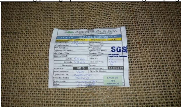
Label Jute cloth Hilo No. 18 mixed, inspected and sampled at Agave factory at El Platanar, Moncagua, San Miguel on June 25, 2021.

The following photographs were taken during sampling of Jute cloth at random: