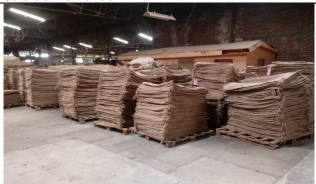
During inspection and sampling of Jute cloths at Agave factory located at El Platanar, Moncagua, San Miguel on June 25, 2021.