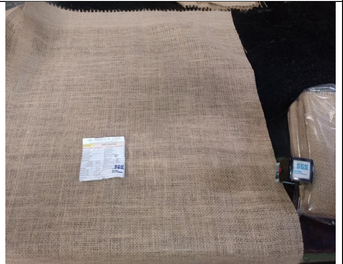
Samples of jute cloth Hilo No. 10 taken at Agave factory on June 25, 2021.

Issued at San Salvador, El Salvador on July 29, 2021.